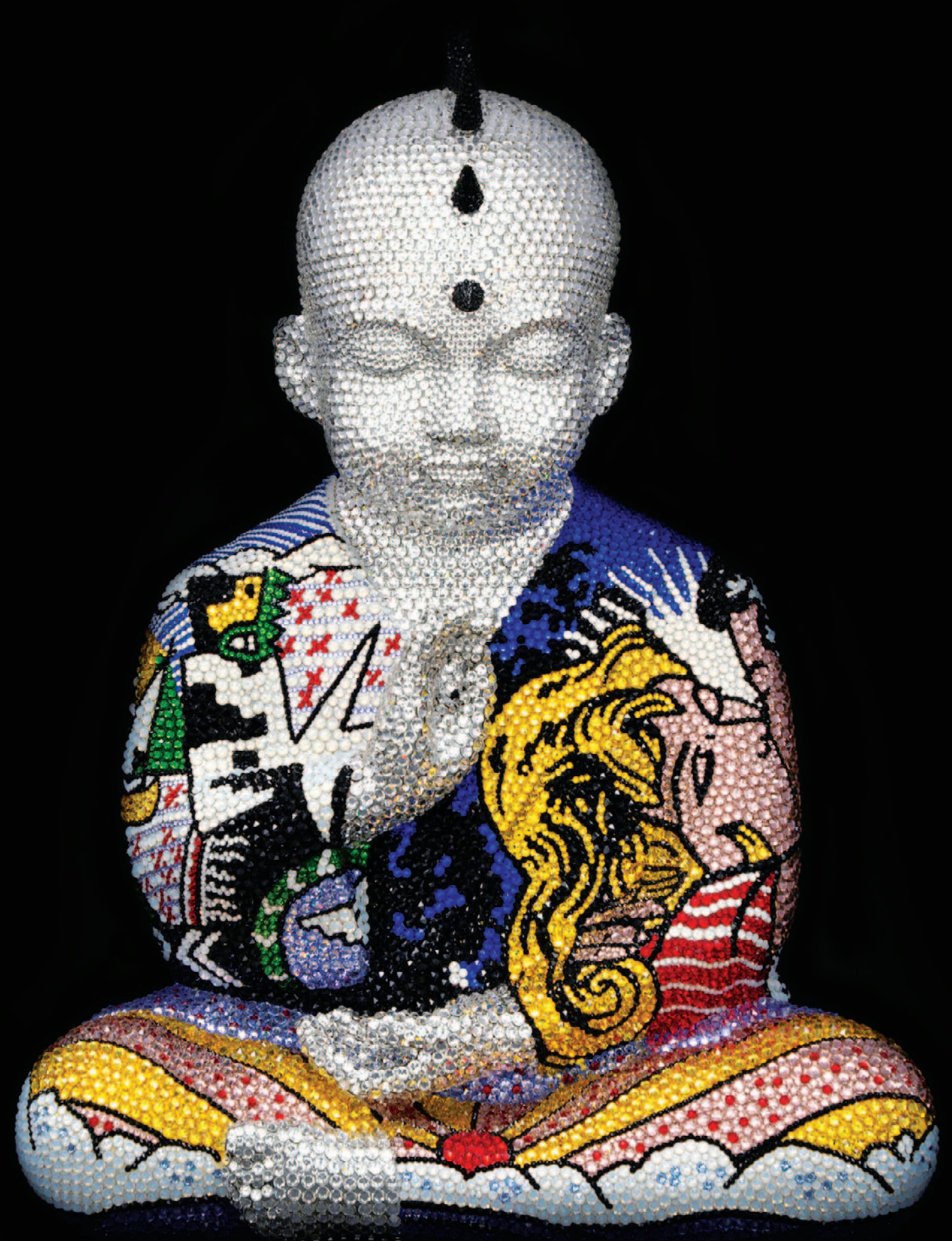
Metis Atash, Punkbuddha, A Quite Conversation feat. Lichtenstein, 2020 Fiberglass, Acrylic Paint, 28,000 Swarovski Crystals, 18 x 14 x 12 in.